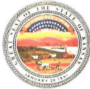
PETE DEGRAAF 82 nd District

Kansas State Capitol Building Room 459-W 300 SW 10th Street Topeka, KS 66612-1504 785-296-7693 (During session)