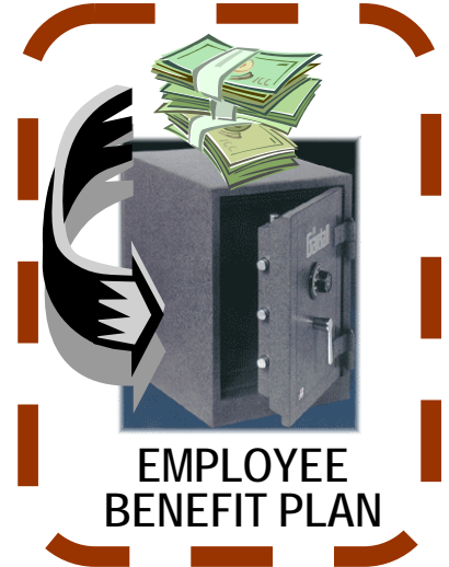
EMPLOYEE BENEFIT PLAN