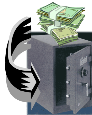
CORPORATION PARTNERSHIP UNINCORPORATED ASSOCIATIONS