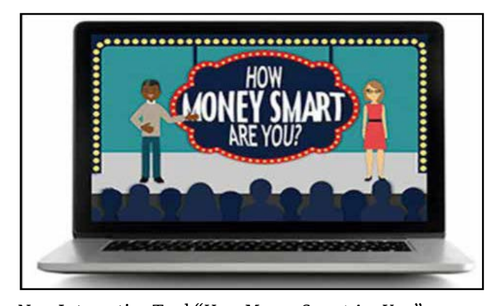
New Interactive Tool "How Money Smart Are You"

How Money Smart Are You? features 14 new games. The games allow users to win virtual coins for correct answers and potentially earn a Certificate of Completion for each game.