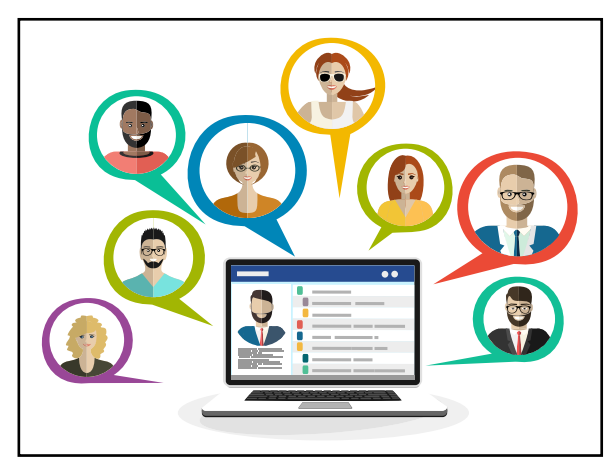
FDIC held 25 webinars in support of Alliance for Economic Inclusion (AEI) Coalitions.

leaders responding to the financial capability and services needs in their communities in various parts of the country. Twelve webinars featured the FDIC's #GetBanked resources and discussed strategies to connect consumers to safe and affordable bank accounts. In June, the Austin AEI held a webinar focused on empowering women and families through innovative financial services and discussed opportunities to support access to education, childcare, healthcare, and housing. The Los Angeles AEI held a webinar in June that focused on