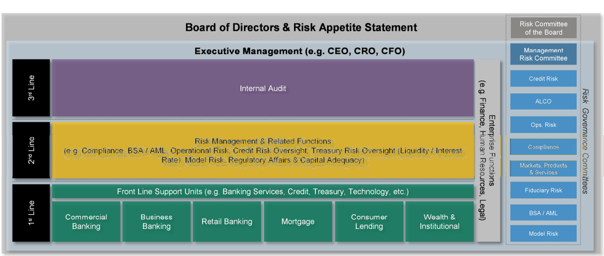
Table P.I-1: M&T Bank Enterprise Risk Framework

The First Line of Defense consists primarily of the front-line business and operational support areas that participate in the delivery of products or services to customers, as well as related servicing and technology. The Second Line of Defense includes the independent Risk Management and Regulatory Affairs Division ("Risk Management Division") which reports to the Chief Risk Officer. The Third Line of Defense is Internal Audit. The Third Line is independent from the First and Second Lines, and provides assurance to senior management and the Board of the effectiveness of risk management programs, policies, processes, practices, and controls, as well as adherence to regulatory standards.