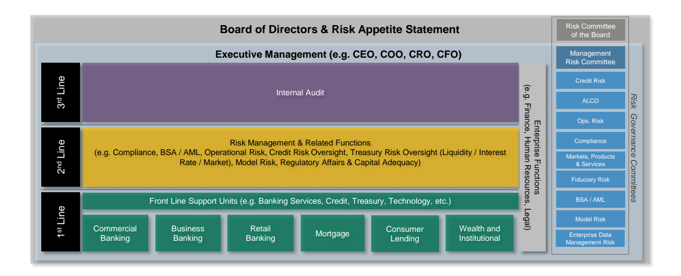
Table P.9-1: M&T Corp Enterprise Risk Framework

Within this context, M&T Corp has developed a substantial governance structure with respect to its Resolution Plan. Under this organization, the Resolution Planning Office ("RPO") is responsible for coordinating the preparation, governance and securing approval of the recurring Resolution Plan. The RPO is a function of the Regulatory Affairs and Capital Adequacy group within the Risk Management Division and resides within the organization's Second LOD. The activities of the RPO are subject to periodic Internal Audit review and assessment.