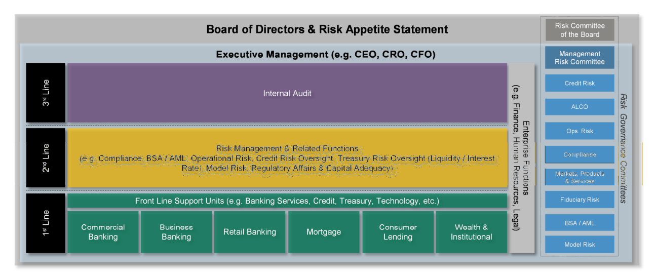
Table P.9-1: M&T Corp Enterprise Risk Framework

The First Line of Defense consists primarily of the front-line business and operational support areas that participate in the delivery of products or services to customers, as well as related servicing and technology. The Second Line of Defense includes the independent Risk Management and Regulatory Affairs Division ("Risk Management Division") which reports to the Chief Risk Officer. The Third Line of Defense is Internal Audit. The Third Line is independent from the First and Second Lines, and provides assurance to senior management and the Board of the effectiveness of risk management programs, policies, processes, practices, and controls, as well as adherence to regulatory standards.