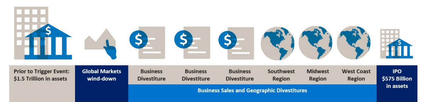
Chart - Multiple Acquirer Strategy

In support of BANA's MAS, the Company's Corporate Strategy and Development Team, along with the Global Recovery and Resolution Planning ("GRRP") Team, determined the following: