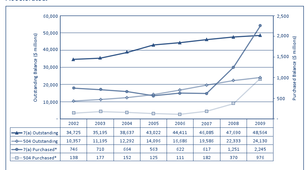
Chart 1: Growth in SBA 7(a) and 504 Loan Volume Moderated in 2008 While Losses Accelerated.

Based on SBA fiscal year of October 1.