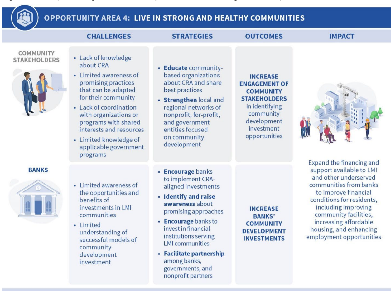
Figure 6. Theory of Change for Opportunity Area 4: Live in Strong and Healthy Communities

The strategies that the FDIC implements in this Opportunity Area will result in growth in bank loans, investments, and services that are responsive and contribute to positive community development