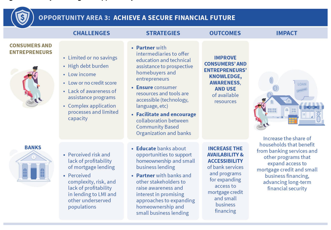
Figure 5. Theory of Change for Opportunity Area 3: Achieve a Secure Financial Future