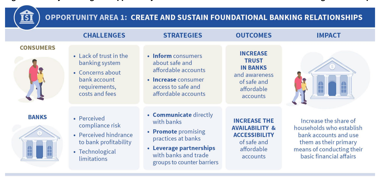
Figure 3. Theory of Change for Opportunity Area 1: Create and Sustain Foundational Banking Relationships

A primary objective of the FDIC's work in this Opportunity Area is to increase the share of households that establish and sustain bank accounts, using them as their primary means of conducting their basic financial affairs. To advance this objective, the FDIC will implement strategies that address challenges and leverage opportunities for expanding bank account access and use. As reflected in Figure 3 , key challenges for consumers include a lack of trust in the banking system and concerns about requirements and costs associated with bank accounts. To improve consumer trust in the banking system, the FDIC will leverage strategic partnerships with trusted organizations that serve the unbanked and underbanked to raise their awareness about the benefits of safe and affordable accounts. In particular, the FDIC will seek out partnerships with organizations that serve LMI and other underserved consumers.